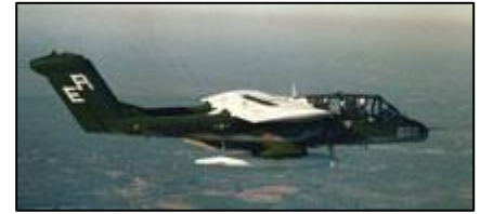
Our speaker also flew the Marine OV-10.

“WILLIE” FLIGHT 82 Order of Daedalians P.O. Box 11261, Chandler, AZ 85248 http://www.willieflight.org Volume 38, Issue 3, March 2020