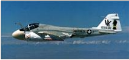
Our speaker flew the Marine version of the A-6.

“WILLIE” FLIGHT 82 Order of Daedalians P.O. Box 11261, Chandler, AZ 85248 http://www.willieflight.org Volume 38, Issue 3, March 2020