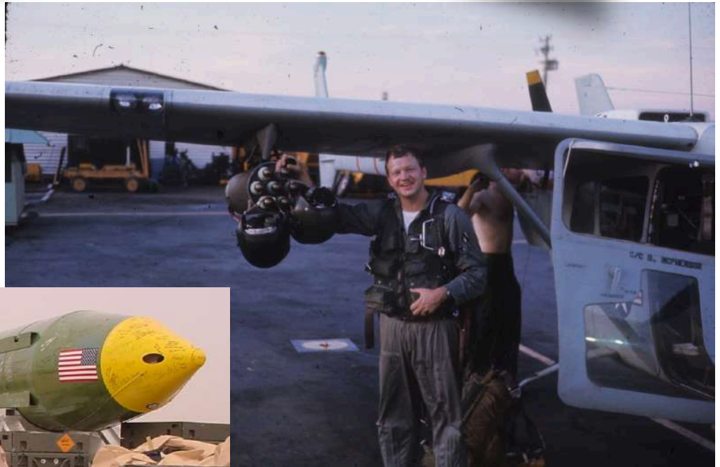
FAC to MOAB