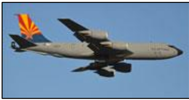
The 161 ARW flies the KC-135R.