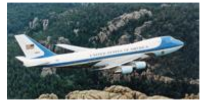
The VC-25 (a 747 variant) became AF-1 in 1987.