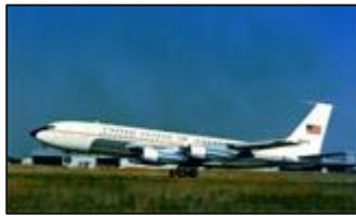
The VC-137 was AF-1 until the VC-25 took over.