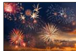
Have a Happy New Year!