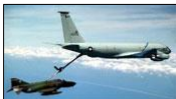
Lt Col Diedrichs flew the KC-135 "Stratotanker".