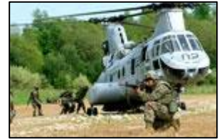
US Marines exercise with CH-46.