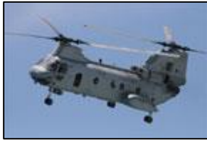
US Marine Corps CH-46 "Sea Knight".