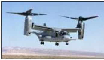
USAF Special Ops CV-22 Osprey.