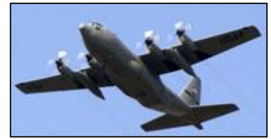
BGen Harvel flew the C-130 in the AF & ANG.