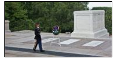
Current Tomb of the Unknowns.