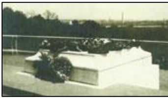
1st Tomb of the Unknowns, 1920s.