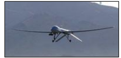
He also commanded the 214th Recon Group.