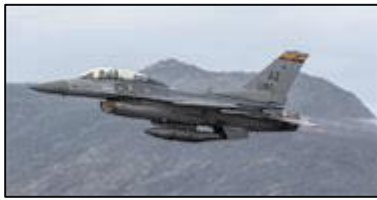
Gen McGuire flew the F-16 Fighting Falcon.