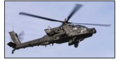
Our speaker also flew the AH-64 "Apache".