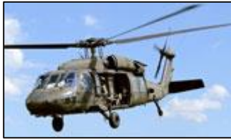
Our speaker flew the UH-60 in SW Asia.